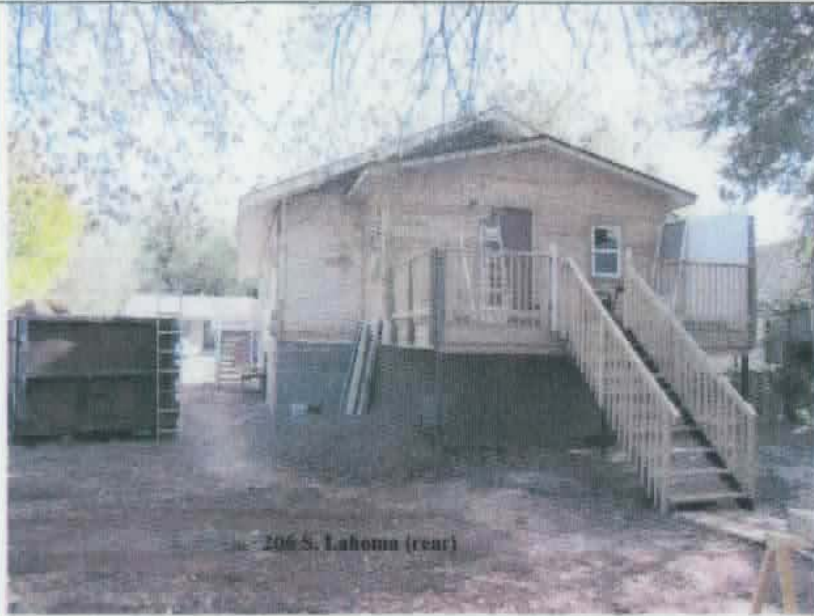
206 S. Lahoma (rear)

If submitting more photographs than will fit on the preceding page, affix the additional photographs below. Identify all photographs with: date taken; "Front View" and "Rear View"; and, if required, "Right Side View" and "Left Side View." When applicable, photographs must show the foundation with representative examples of the flood openings or vents, as indicated in Section A8.