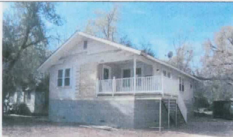
206 S. Lahoma (front)

If using the Elevation Certificate to obtain NFIP flood insurance, affix at least 2 building photographs below according to the instructions for Item A6. Identify all photographs with date taken; "Front View" and "Rear View"; and, if required, "Right Side View" and "Left Side View." When applicable, photographs must show the foundation with representative examples of the flood openings or vents, as indicated in Section A8. If submitting more photographs than will fit on this page, use the Continuation Page.